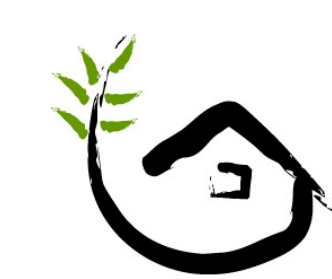
non-toxic paints and finishes, wool insulation