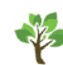
oil-finished, FSC certified ash flooring