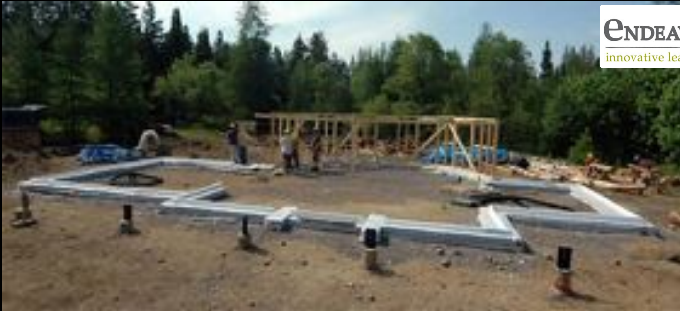
Earthbag foundation with natural stone post footings.