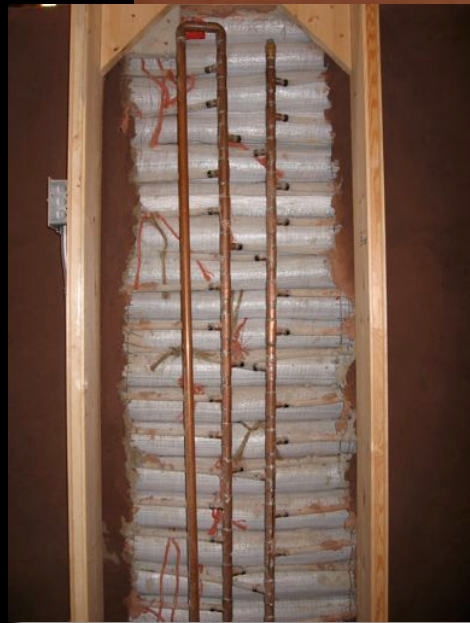
Earthbag and earth plaster radiant wall